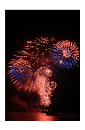
Royal William Yard