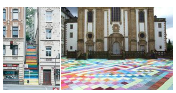
From L to R

Jewellery Quarter Birmingham – Pavement Trail